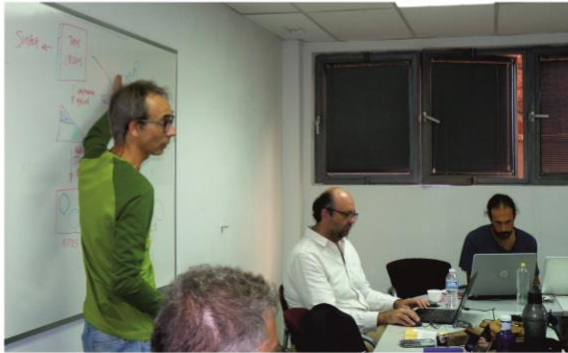
marine sampling North Sea, England 1994 postgraduate lecturing Madrid, Spain 2016