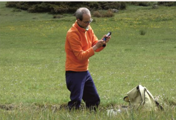
freshwater metagenomic sampling Picos de Europa, Spain, 2021