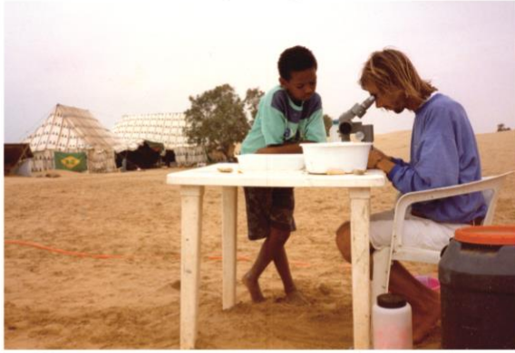
marine sampling, Sahara, 1998