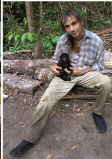
biodiversity prospection Peruvian Amazon, 2004