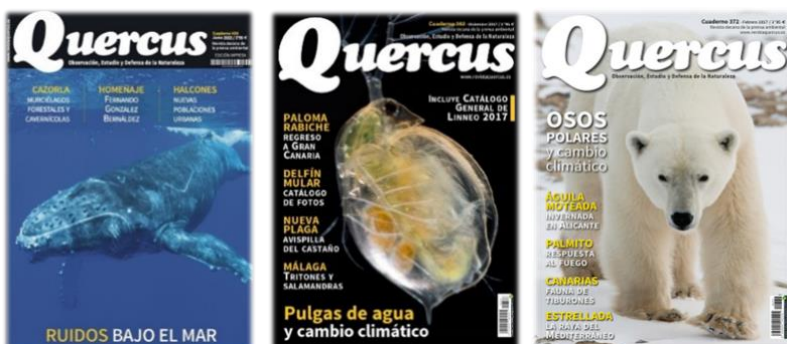
journal covers featuring my articles