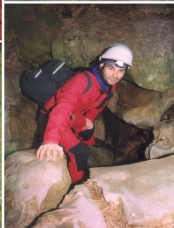
biospeological sampling Levante, Spain 2001