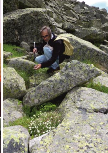
lizard sampling Gredos, Spain, 2017